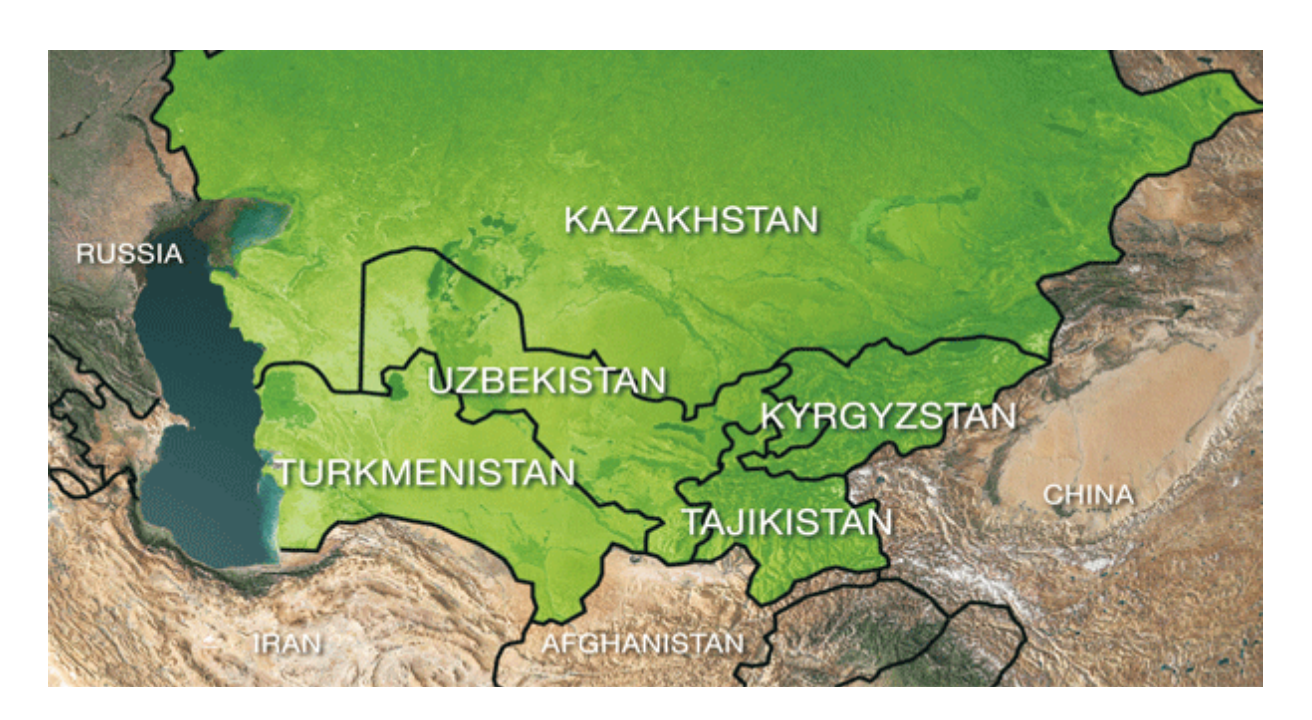
Fig. 1. Map of Central Asia