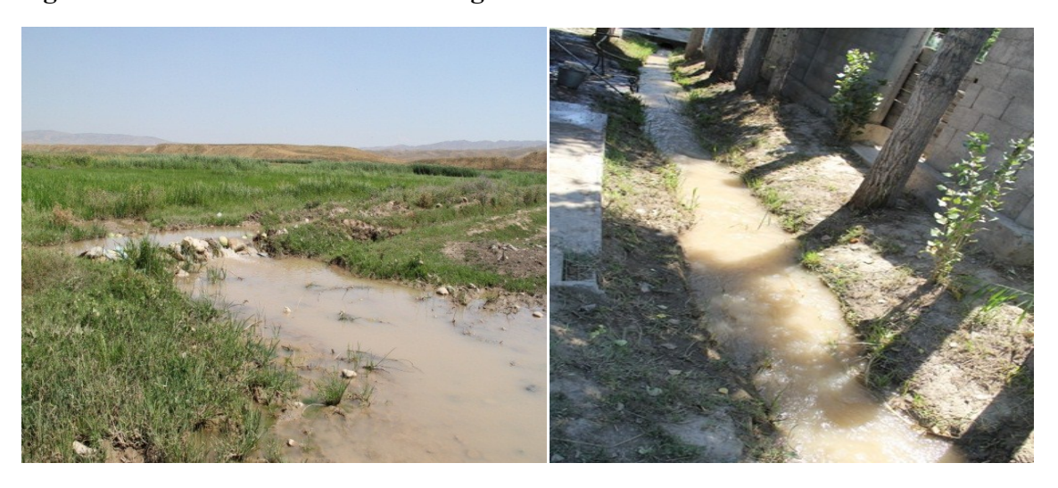
Figure 2. Water Canals in Bazar Korgon AA

The climate in the area is temperate, continental with dry summers, with the majority of the land being arid and semi-arid. There are about 17,915 ha of arable land in this AA, with 14,086 ha being irrigated (averaging 0.77 ha per person). The overwhelming majority of the communities are small land holding farmers, who grow mostly vegetables, feed crops, and cotton. All interviewees noted that the major source of income is remittances from the labor migrants working in Russia.