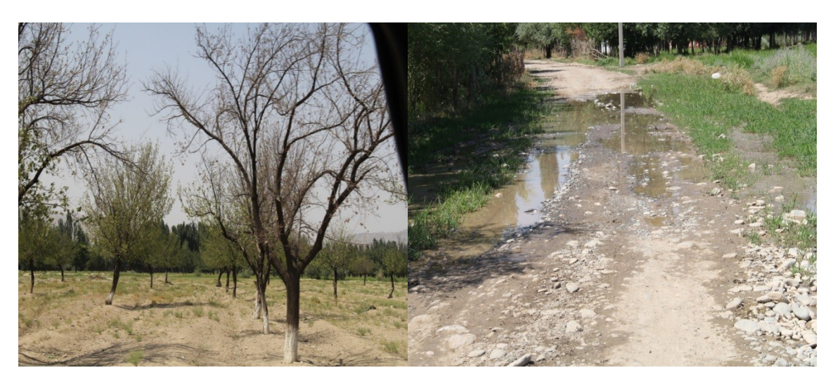
Figure 4. Horticulture in Downstream Village and Flooded Roads in Upstream Village of Tort Kul AA