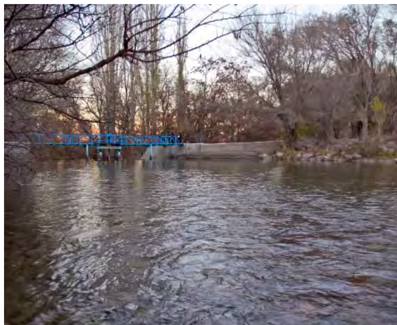
Water intake of Kyrgyz Republic.