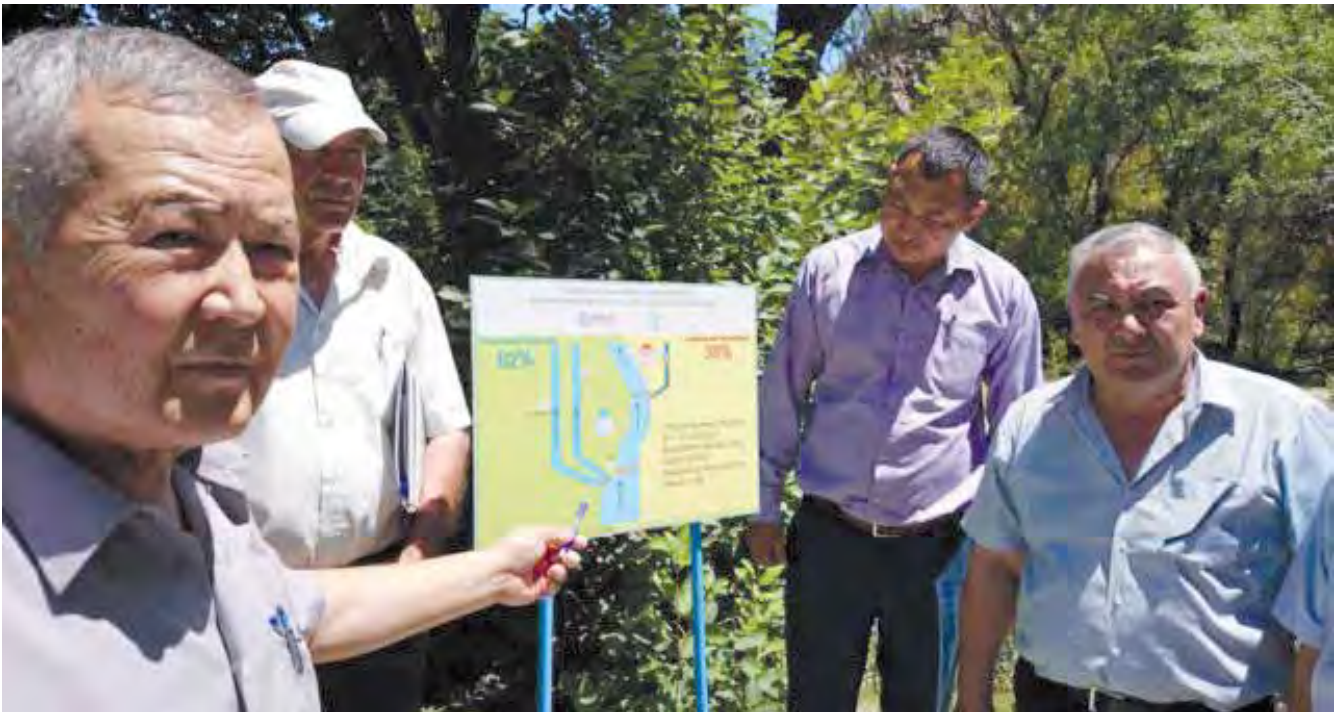
On the opening of the inter-governmental water measuring system on Aspara River.