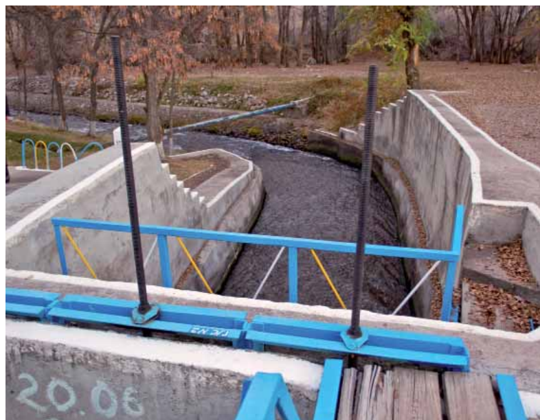
Inter-governmental hydro post .