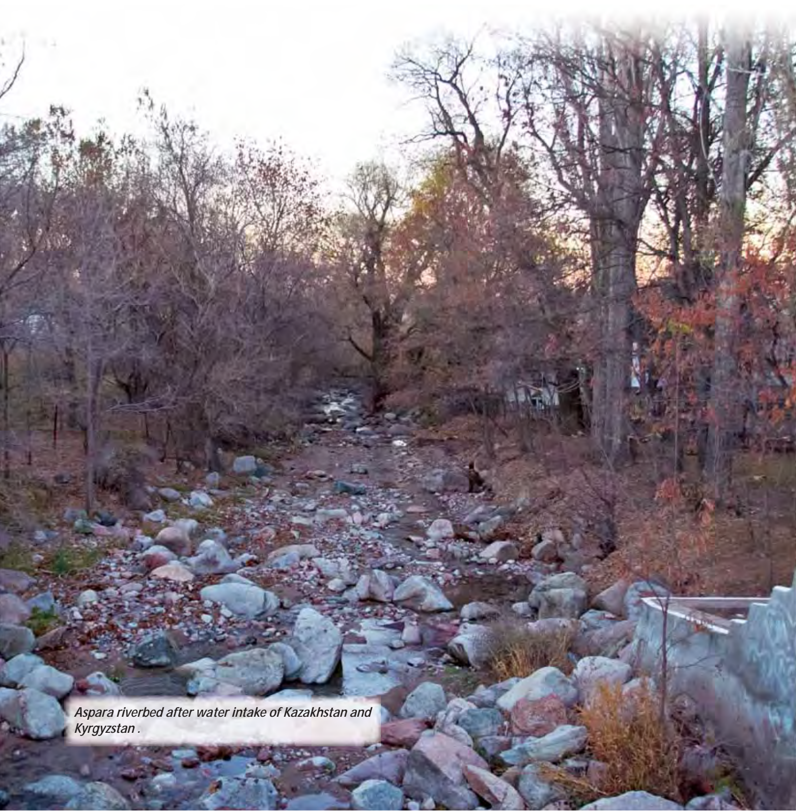
Aspara riverbed after water intake of Kazakhstan and Kyrgyzstan .