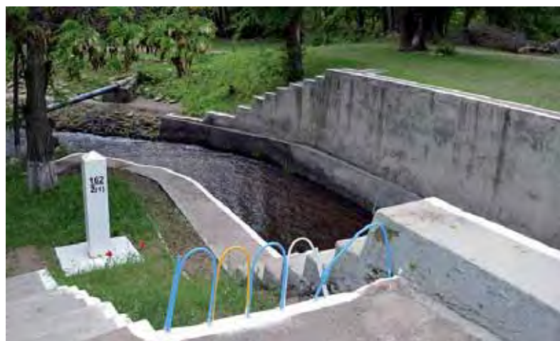
The head of one of the irrigation canals from Aspara River.