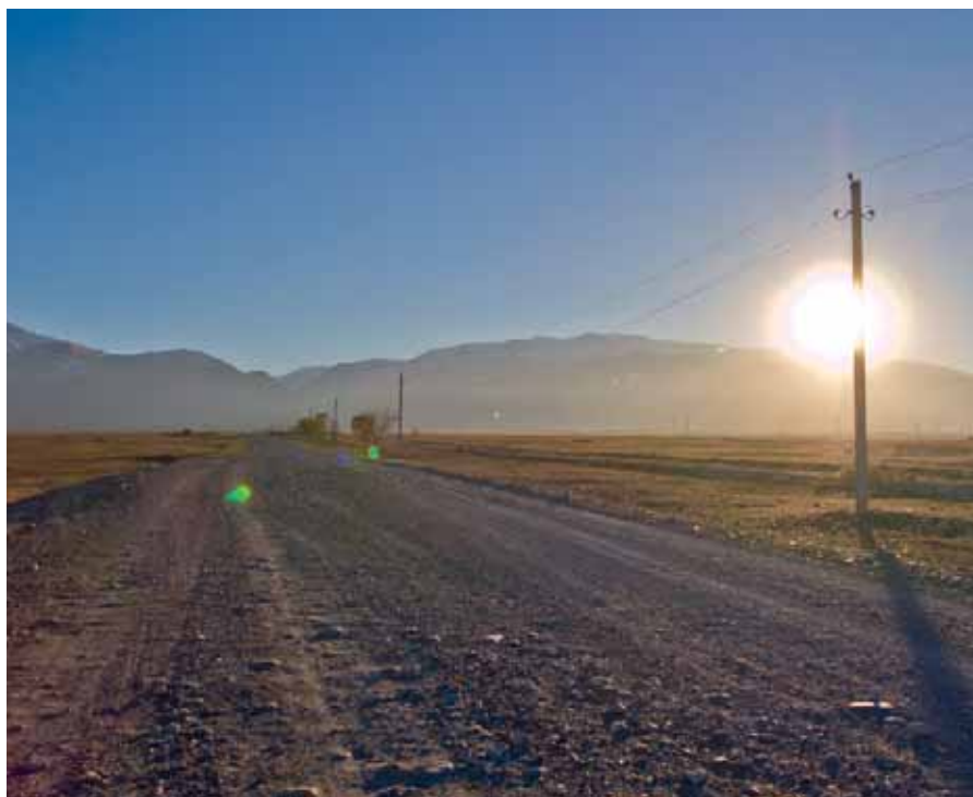
The road from the Bishkek-Merke route to Cholok Aryk village.