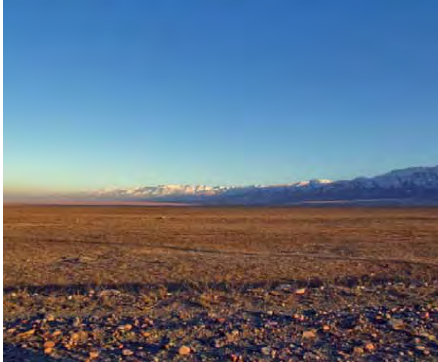
Aspara river valley.

The spring – from mid-March until May – brings unstable and primarily