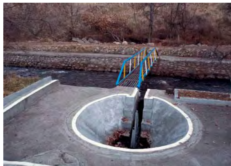
Hydro post for water flow and water quality measurement .