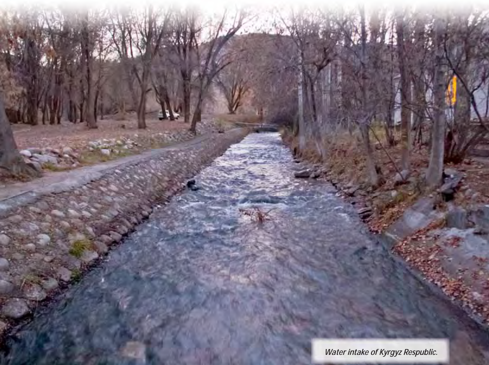
Water intake of Kyrgyz Republic.

The draft plan is based on, but not limited to, the mentioned above materials.