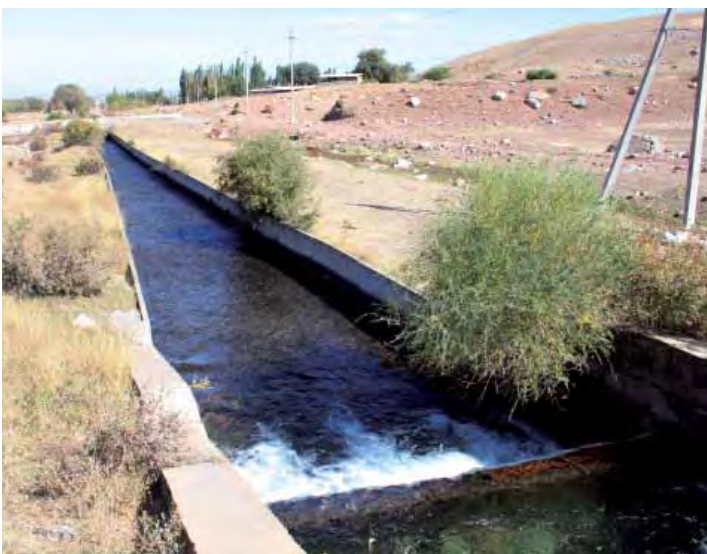
«Verhniy» irrigational canal .

The effort to create the river basin and land use maps is the primary step in developing the basin plan. The corresponding GIS-maps had been executed within the framework of the project and will be transferred to operator organizations and SBCs.