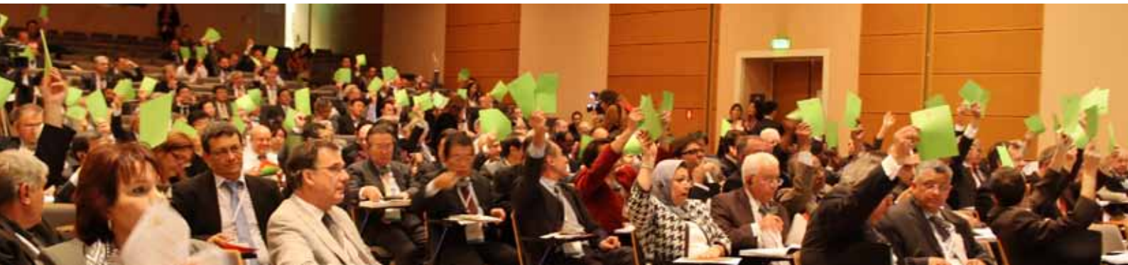
2009 General Assembly

Members are the heart of the Council as they have an important role both in its Governance and in its activities.