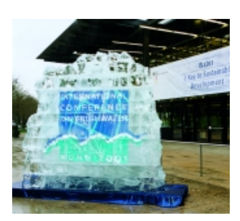
The Conference Venue

We, ministers with responsibilities for water affairs, environment and development from 46 countries throughout the world, have assembled in Bonn to assess progress in implementing Agenda 21 and to discuss actions required to increase water security and to achieve sustainable management of water resources.