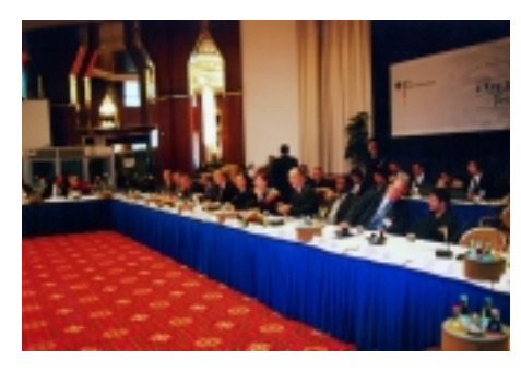
Ministers from all over the world adopted the Ministerial Declaration during the Ministerial Session on 4th December 2001

Water development programmes, to be successful, should be based on a good understanding of the negative impact desertification causes to people living in affected areas.