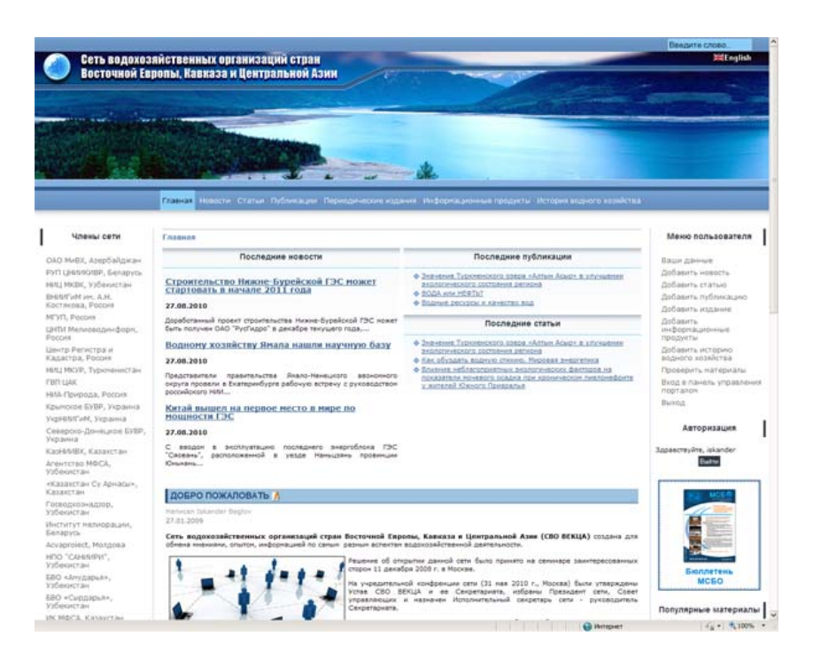
NWO EECCA web-site

All sections of the web-site were updated regularly during the reporting period. The average visits of the web-site were 200-250 persons a day.