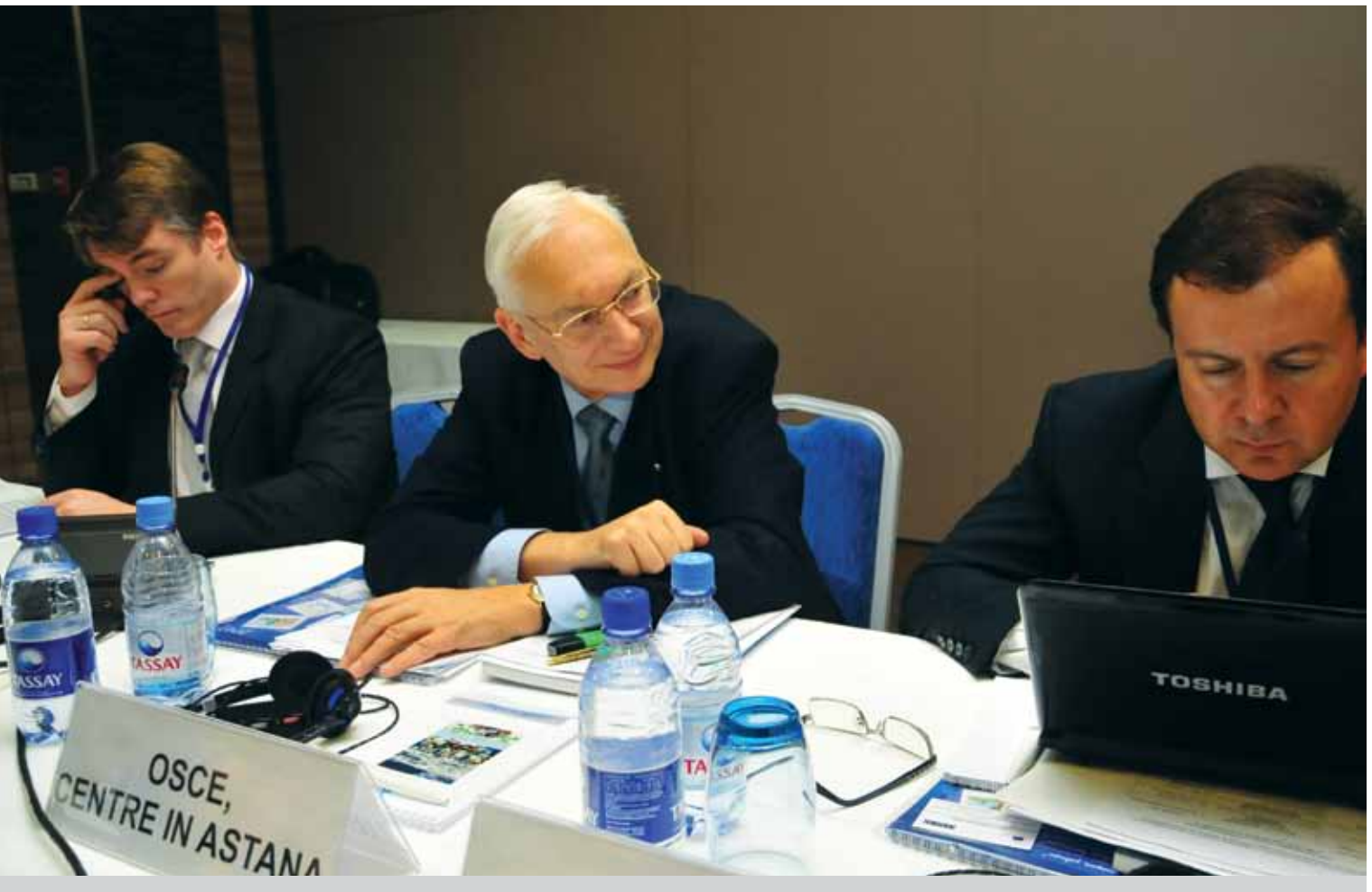
Representatives of international organizations on the Coordinating Conference of Donors for the Third Aral Sea Basin Program, Almaty, December 9, 2010.

International Water Assessment Centre (IOWater) "Capacity building in data administration for assessing transboundary water resources in Eastern Europe, Caucasus and Central Asia (EECCA)" (Pilot area - the Aral Sea) is undergoing. The UNECE is also part of the project. On 25-26 May 2011, the FFEM had organized a Workshop for the Kazakh users of the final product of the project, the information database.