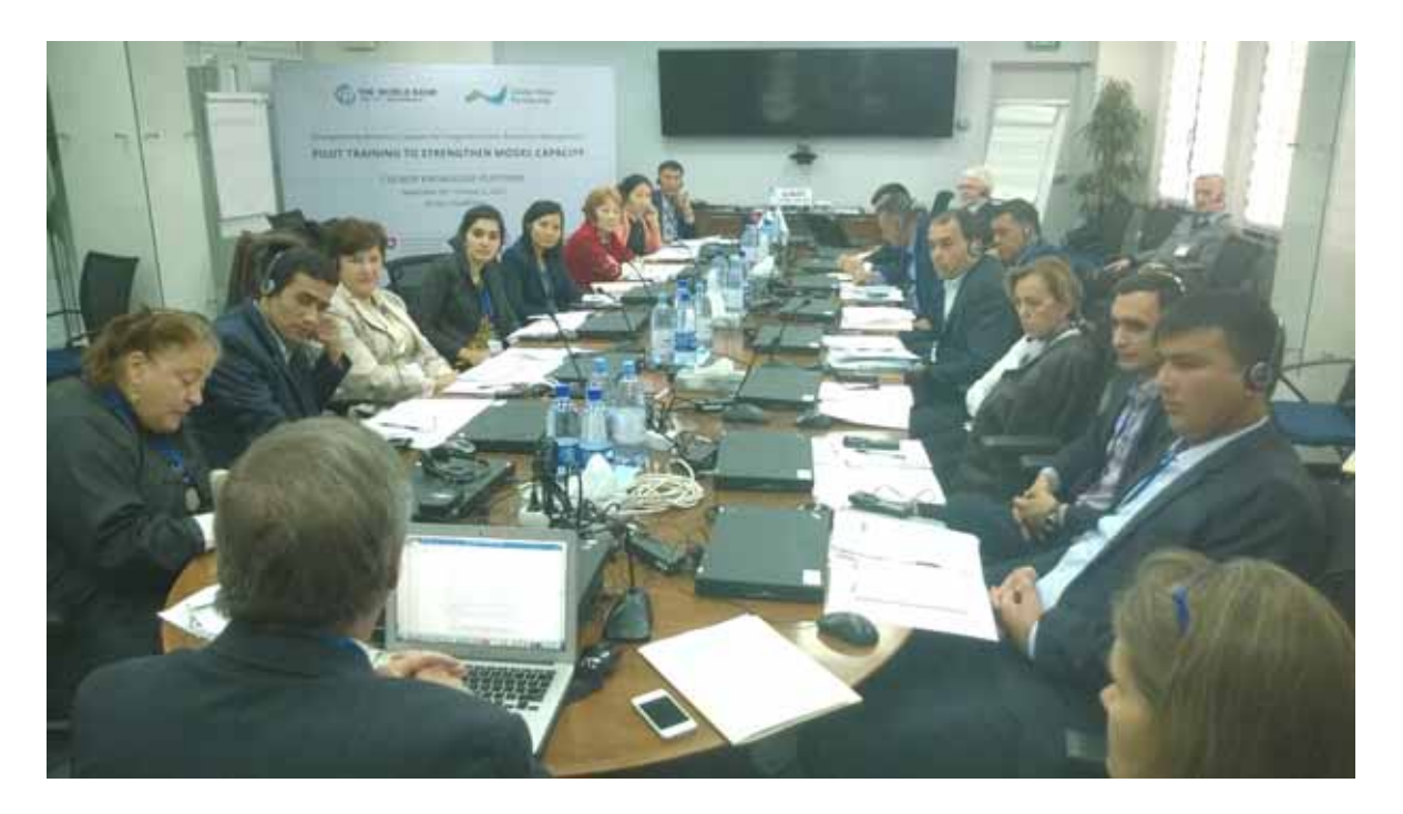
Working moments of the seminar