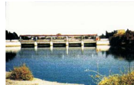
Headwork of interstate canal "Dustlik"

"Sigma" system launch and adjustment works on Uchkurgan hydrounit are being done with the assistance of SDC.