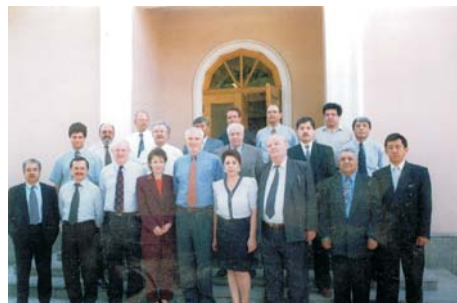
• After signing Agreement between IFAS and World Bank on GEF Project beginning, April 1998

To enrich decision makers - water sector leaders - with progressive methods it is important that they take part in study tours on water management activity in the leading countries of the world.