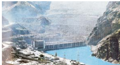
• Nurek hydro power station dam