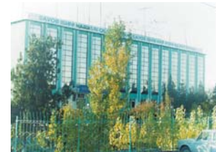
• BWO "Amudarya", Urgench

Taking into account scarcity of water resources in the region, water-saving is not less important component of the Commission work.