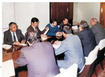
First ICWC meeting