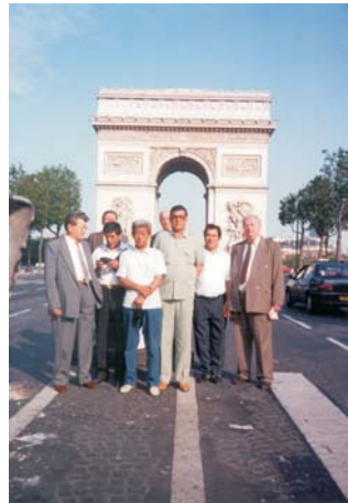
• ICWC delegation in Paris

Specialists of ICWC scientific and design organizations participate in carrying out a number of international programs and projects.