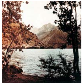
• Charvak reservoir

Work plan of the group on legal issues includes revision and preparation for submission a whole package of agreements on seven directions, among which continuation of works on revision of interstate agreements "On the main principles of Syrdarya River basin transboundary water resources joint and rational use" and "On transboundary water resources conservation, rules on control of their quality and guaranteeing environmental sustainability in the region" is of primary importance.