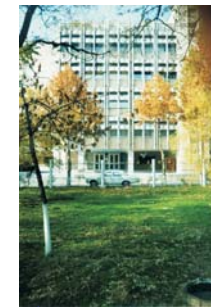
• BWO "Syrdarya", Tashkent

In 1960, total water intake in the Aral Sea basin was 60 610 million m 3 , but by 1990 it increased to 116 271 million m 3 , or by 1.8 times. For the same period, the population on the indicated territory rose up by 2.7 times, irrigated areas increased by 1.7 times, agricultural production by 3 times, gross national product almost by 6 times (see table). After the Soviet Union collapse in 1991, total water use in the region started to decrease that was caused by general economic degradation.