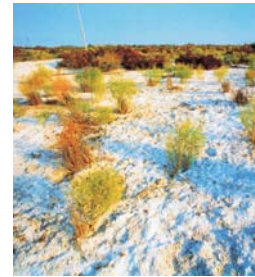
Dried bottom of the Aral Sea

Just because of that the world-wide interest in ICWC experience is intense enough as well as willing to help to solve the Aral Sea problems on behalf of whole international community.