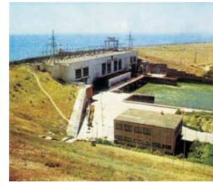
• Hydro structure on Chardara reservoir

In Soviet times two basin water organizations BWO "Amudarya" and BWO "Syrdarya", founded by the Ministry of Water Resources of the USSR, were responsible for basin water resources management and control. Scientific Production Association "SANIIRI" fulfilled the functions of Regional Scientific Center on Water Resources.