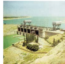
• Karakum reservoir