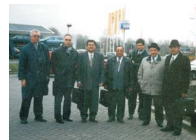
ICWC delegation at the 2 nd World Water Forum, Hague, 2000

During 5 days of the Forum work, ICWC and IFAS specialists held many bilateral and multilateral meetings with the representatives of international organizations and foreign partners to discuss cooperation extension.