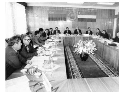
• ICWC meeting in Nukus, October 1993