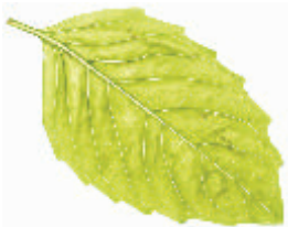
Natural plant leaf – the single integrated system

The process of developing the hydrographization chart should start bearing in mind the following considerations regardless of water distribution levels: