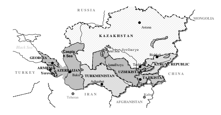
Figure 1. Location of the Central Asia and Caucasus countries

tem of financing and initiatives is to be established. Thus, it is clear that the art of water management is an integrated (multi-faceted) process, which in the current practice is referred to as integrated water resources management (IWRM).