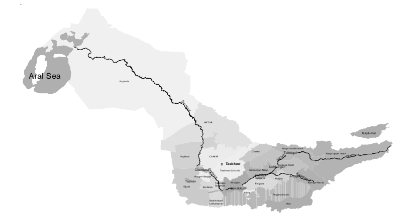
Figure 2. The Syr Darya River basin (Eleven administrative units - provinces of Kazakhstan, Kyrgyzstan, Tajikistan and Uzbekistan are located within the hydrological boundaries of the basin), which sub-divided into 19 water-economic zones.

example) or its geomorphologic pattern is very complicated. In this case, a hierarchical framework of water governance system should be established within the basin, but with observance of the hydrological principle. Its subdivisions can control separate parts of the basin-sub-basins or sub-systems.