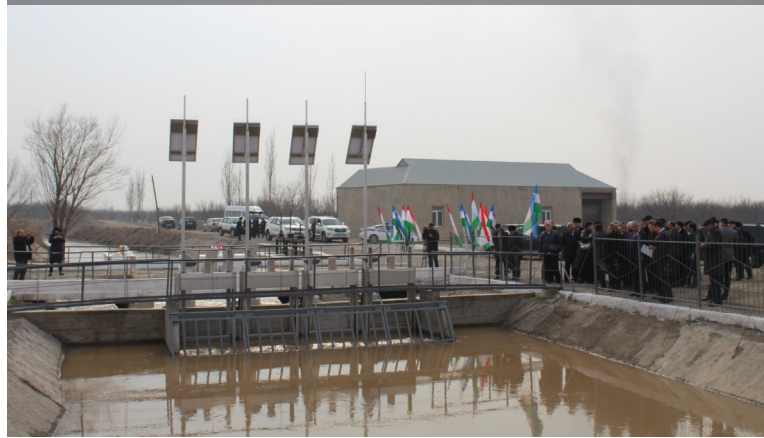
Opening ceremony for the automated Patar and Sarvat gauging stations, February 23, Gulistan, Tajikistan

By January 1, 2025, 7 meetings of the Working Group (WG) were held. Two meetings were held in 2024: (1) the 6th meeting reviewed the "Reconstruction of the Patar and Sarvat gauging stations on the inter-state Big Fergana Canal and North Ferghana Canal" project and subsequently inaugurated these gauging stations to enable real-time water monitoring and improve transboundary water management (February 23, Gulistan, Tajikistan); (2) the 7th meeting focused on implementation of new transboundary projects in the water sector and on the use of water resources from Lake Sarez. An agreement has been finalized to create a cooperation framework for the construction and operation of the Rogun HPP, based on a balance of the parties' respective interests and positions (August 3, Dushanbe, Tajikistan).