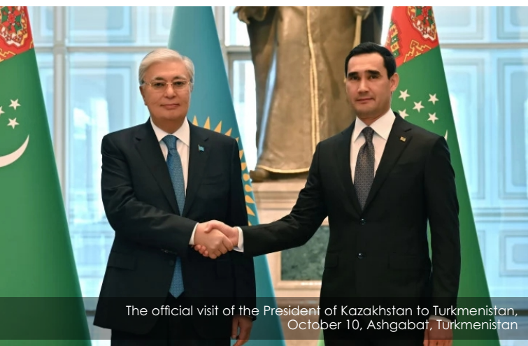
The official visit of the President of Kazakhstan to Turkmenistan, October 10, Ashgabat, Turkmenistan

During the official visit of the President of Kazakhstan to Turkmenistan, the Declaration on Strengthening Friendship and Deepening Multifaceted Strategic Partnership between Turkmenistan and the Republic of Kazakhstan was signed. Among other things, the Parties: (1) have noted the importance of collaboration in the area of environmental safety and protection, rational use of natural resources, prevention and management of natural and man-made disasters and so on; (2) welcomed the initiatives to open