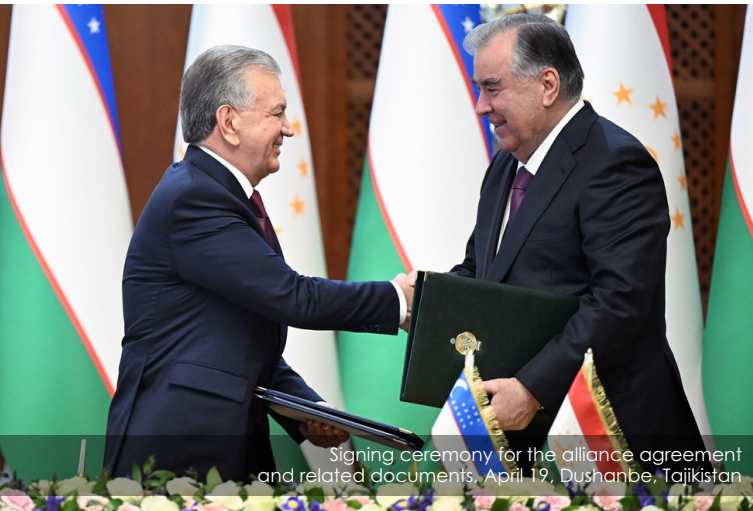
Signing ceremony for the alliance agreement and related documents, April 19, Dushanbe, Tajikistan

Following the negotiations, a Treaty on Allied Relations and a package of ministerial documents were signed (April 18-19, Dushanbe, Tajikistan).