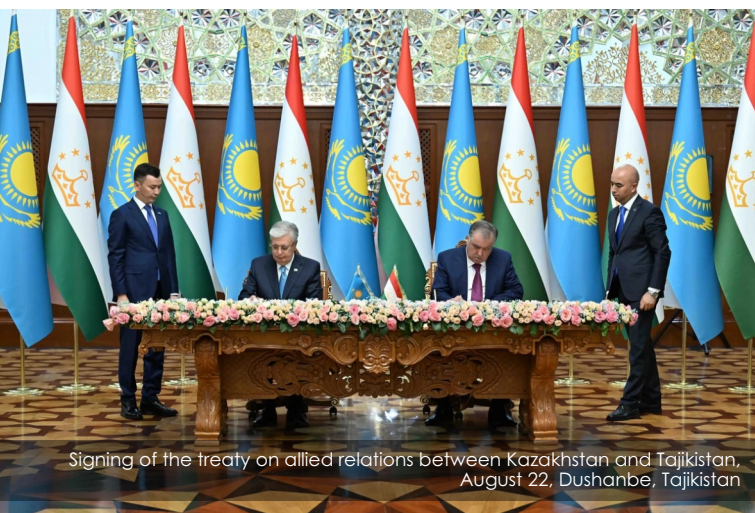
Signing of the treaty on allied relations between Kazakhstan and Tajikistan, August 22, Dushanbe, Tajikistan

The President of Kazakhstan paid a state visit to Tajikistan. The Parties set the goals of bilateral cooperation in the area of agriculture, water and energy, transport, and transit. As a result of negotiations, they signed a treaty on allied relations, as well as other documents, including Memoranda of Understanding on oil and gas cooperation between the Kazakh Ministry of Energy and Tajik Ministry of Energy