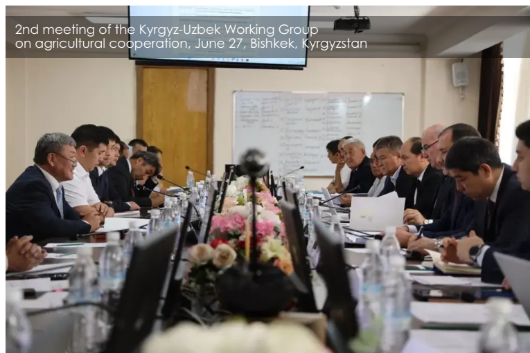
2nd meeting of the Kyrgyz-Uzbek Working Group on agricultural cooperation, June 27, Bishkek, Kyrgyzstan

bypass canals on the Uzbek side (April 22, Andizhan, Uzbekistan); (2) discussed implementation of schedules of water withdrawals from the inter-state canals and operation of the Kasan-Say reservoir, hydraulic facilities in the border areas, "Friendship" pumping station, etc.; exchanged ideas on how to harmonize a regional strategy for the rational use of transboundary rivers in Central Asia (October 4, Osh, Kyrgyzstan).