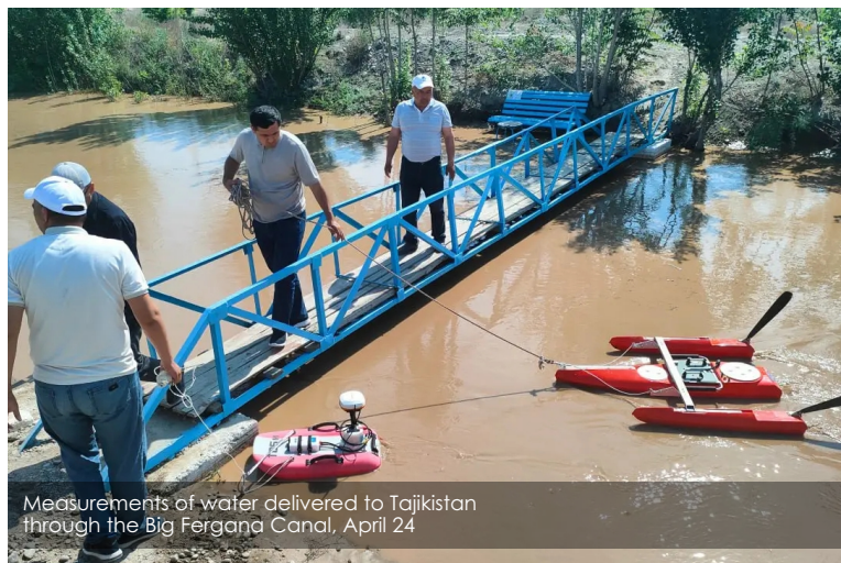
Measurements of water delivered to Tajikistan through the Big Fergana Canal, April 24

In 2018, the parties reached an agreement on Uzbekistan's engagement in the construction and operation of two HPPs on the Zarafshan River. In June 2021, the parties signed an agreement on development of a feasibility study for the HPPs and on the establishment of a joint-stock company.