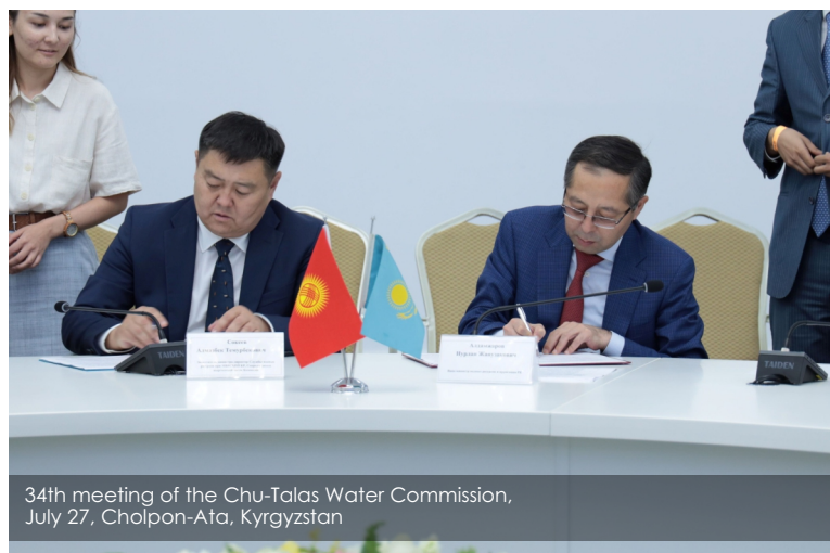
34th meeting of the Chu-Talas Water Commission, July 27, Cholpon-Ata, Kyrgyzstan

Working Group on environment protection (WGEP) under the CTWC Secretariat. At its 12th meeting, the WGEP discussed: (1) water quality monitoring; (2) hydrometeorological monitoring; (3) hydrodynam-