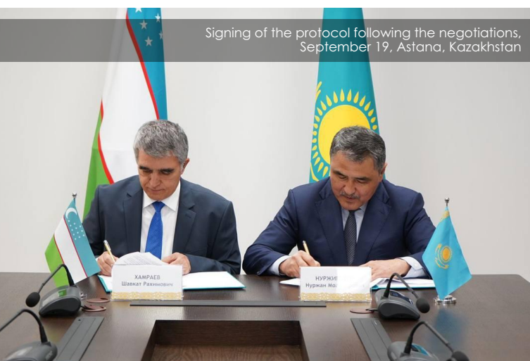
Signing of the protocol following the negotiations, September 19, Astana, Kazakhstan

The governments hold negotiations with international organizations to get support for the project. Following the meeting, the Ministers signed a Protocol.