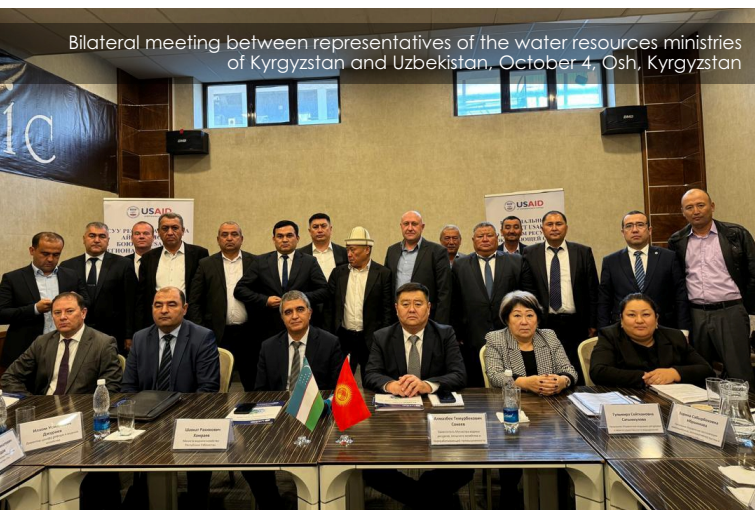
Bilateral meeting between representatives of the water resources ministries of Kyrgyzstan and Uzbekistan, October 4, Osh, Kyrgyzstan