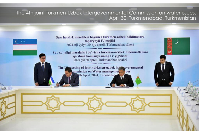
The 4th joint Turkmen-Uzbek Intergovernmental Commission on water issues, April 30, Turkmenabad, Turkmenistan

The 18th meeting of the Joint Turkmen-Uzbek Commission on Trade-Economic, Scientific-Technical, and Cultural Cooperation focused on reviewing the implementation of existing agreements and identifying promising avenues for further multifaceted growth. Participants exchanged views on key sectors, including energy, agriculture, and water management. The session concluded with the signing of a formal Protocol (July 16, Tashkent, Uzbekistan).