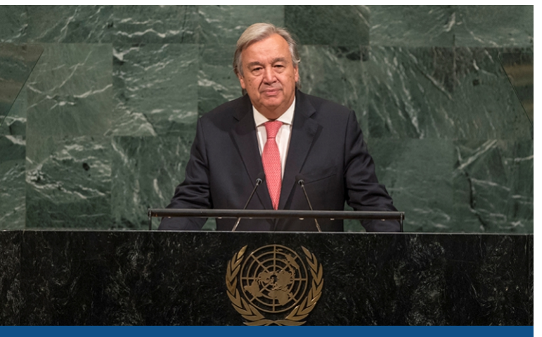
"Global challenges require global solutions. It is not enough to proclaim the virtue of multilateralism; we must prove its added value."