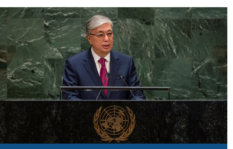
Galvanizing multilateral efforts for poverty eradication, quality education, climate action and inclusion

A nuclear-weapon-free world, preventive diplomacy, combating terrorism, enhanced regional cooperation, economic development and democracy. This is an incomplete list of priorities of the Government of Kazakhstan. Those were mentioned by Mr. Kassym-Jomart Tokayev, President of the Republic of Kazakhstan from the rostrum of the UNGA.