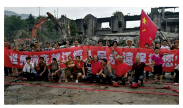
Dujiangyan community members celebrating the demolition of the Shengxing power station in Sichuan Province. The banner reads "We will protect you forever, Dujiangyan World Heritage Site!"

In a campaign to improve environmental conditions in 11 key river basins (Yangtze, Huanghe, etc) the authorities ordered decommissioning of "illegal" and "harmful" small hydropower plants, which in the first year led to closure of at least several hundred power plants, located in protected areas or sensitive river stretches.<sup>61</sup> One high-profile case in Sichuan province involved demolition of an illegally-constructed hydropower station located inside the buffer zone of the ancient Dujiangyan Irrigation System, a protected UNESCO World Heritage Site and the world's oldest fully operational hydraulic engineering project.62 While decommissioning so far affected small portion of China's 77 000 small hydropower plants, all remaining have been ordered to follow more stringent environmental regulations than before. Thus Guangdong, Jiangxi, Gansu, Chongging and other provinces (cities) have issued guidelines for the environmental flow management downstream of the dam, putting forward specific requirements on